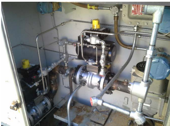
Figure 4 - Fuel Gas Cabinet after a retrofit to Single Fuel Control Valve Control System

These valves also include integrated position resolvers that are used as feedback to enable very precise positioning. And since the valve position is available to the TFR system as an analog signal, it is used for diagnostics and tracking verification. Onboard internal diagnostics also alert the control system if a problem is detected.