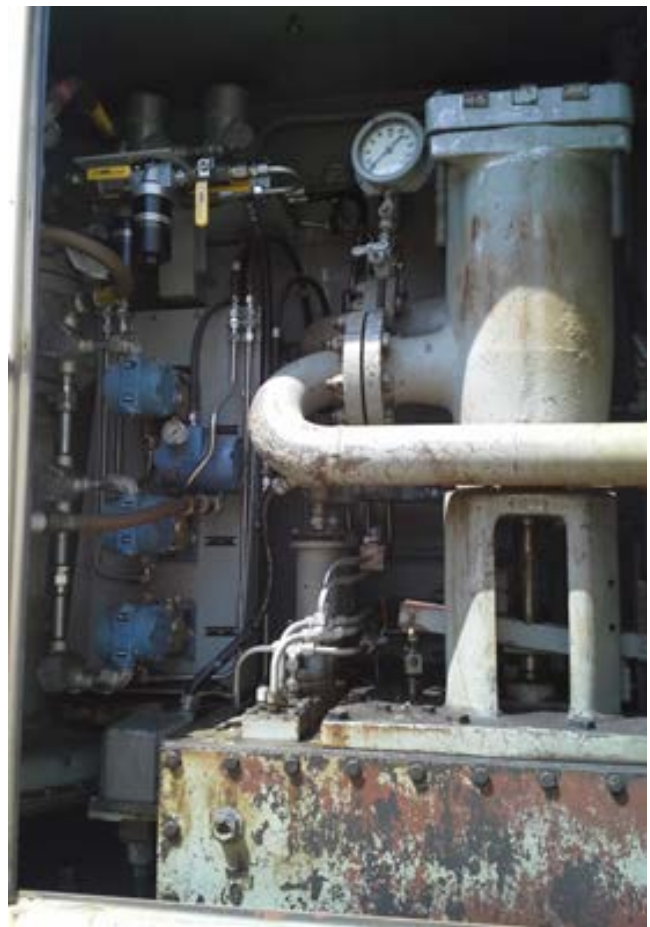
Figure 1 - Fuel Gas Cabinet prior to Single Fuel Control Valve Retrofit

Advances in actuator technology have made it possible to simplify fuel delivery systems into single valve systems which require only one electric FCV. Petrotech began installing such systems on GE Frame 5 turbines in the mid-1990s, using its patented mass flow control system and an Electro-Mechanical Servo Actuator (EMSA) valve. Modern fuel control valves, such as the Precision Engine Controls XVG and the Woodward GS16, are purpose-built for turbine fuel control applications and are field proven to perform reliably.